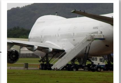
747 in front of Chalcrofts Rough