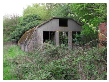
Gun crew hut