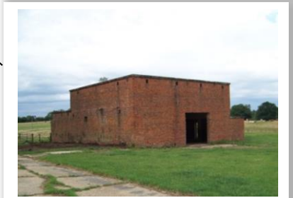
Standby Set House

Dunsfold Airfield was cleared of woodland, farmland and buildings to form the Canadian Air Force airbase in 1942. Units of Canadian troops cleared land requisitioned from the people to form runways, perimeter roads and after little more than one month the first aircraft had landed. The old Brighton Road from Godalming was relocated so that it no longer ran through the site at Pains Hill. The old cast iron milestones were amended by one mile to reflect the additional mileage diversion. Most farm buildings and farm houses were removed with the exception of the Chiddingfold Kennels (now Honey Mead), Primemeads Farmhouse (originally Stitwells Farm) and Broadmeads Cottage (now referred to as Canada House). The latter was moved to the southern perimeter and now stands alongside Benbow Lane.