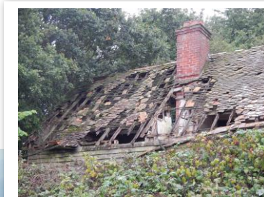
Broadmeads (Canada House)