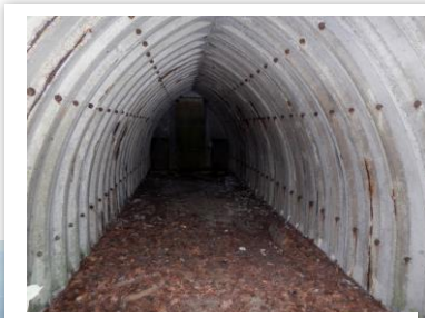
Air Raid Shelter