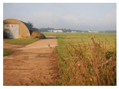
Nissan Hut to eastern peritrack