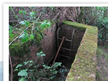
Entrance to Battle HQ