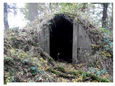
Air Raid Shelter