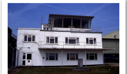
Control Tower and 1942 Canadian Memorial Stone