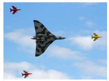
Wings & Wheels